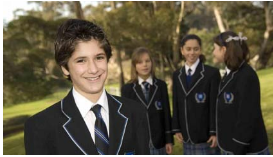
Alphington Grammar School was in the top 10 NAPLAN high schools for Melbourne's north.