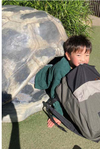
Coming out of his shell

their animal's natural behaviours and exceptional senses. We then visited Melbourne Zoo to observe and understand what enrichment was currently being used around the zoo. Then it was back to school to develop the Juniors' ideas into prototypes and to produce their final product before filming short presentation videos for the zoo keepers to give feedback on.