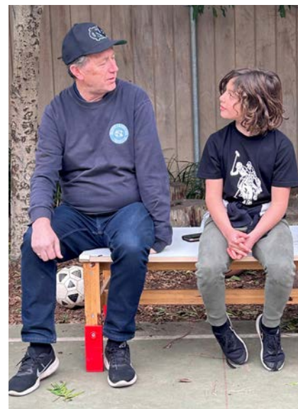
Some wise words for the young man

What I do there depends on what the children are doing. We have played a lot of tag. We have also built many things together including block houses, sandcastles and lego houses. One day we built a volcano in the sandpit and made it 'erupt' with bicarb soda and vinegar. We've often played make-believe games where we pretend to be superheroes, bus drivers, passengers, shop keepers and other characters. There are so many things you can do with the kids. I am learning different ways to play with the children and having fun.