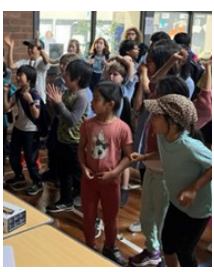
Winners are Grinners

On October 26th, students competed in an interschool chess competition at Coburg North Primary School, with 126 players from 10 different schools. 4 FCS players finished in the top 6 spots!