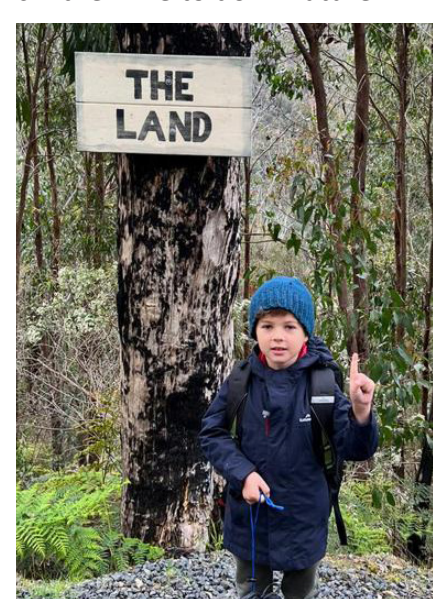
The place to be

Family Day was massive, with many families having not been to The Land due to this even not happening for a couple of years. The old hands were happy to be back while new families were entranced by the magical splendour of this quiet hideaway just an hour from Melbourne. The weather Gods granted a pleasant day for a walk and picnic in the bush, and the kids scampered around as children like to do in nature.