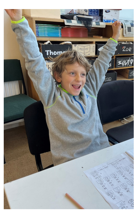
I got it!

We have baked every morning, created a lot of art, performed play after play after play, held an apple juice stall and had a lot of dance parties. I think the loveliest part of holiday program is that friends from the two campuses are able to connect and spend time together. The children are so lovely, creative and fun, it is always a pleasure to share these extra days with them.