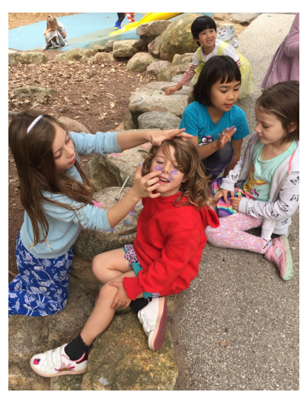
Chalking them up