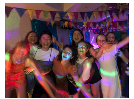
Don't stop me now!

The Disco was wild as ever this year, with a sink hole reappearing in the roof and all the Tinies coming back in their best party outfits. Elva flew back in a UFO with a dozen flying rabbits who all danced like crazy.