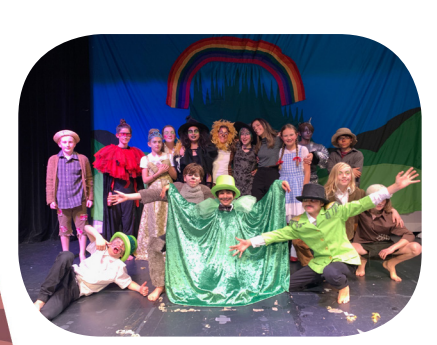
There's no place like home!

The Normanby school production, The Wizards of Oz, closed on Thursday 16 June to rave reviews with audiences across the four shows commenting on the dynamic performance of the students involved.