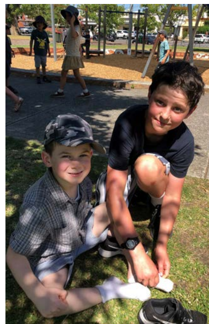
buddies in the park