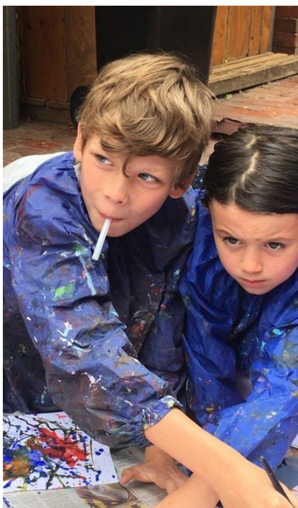
artists at work

There was a pile of wood in a field. A snake lived in the woodpile. It was a cobra. When I went near the pile it raised its hood from its neck!! I knew what that meant. I backed off, but it chased me and I did not know what to do. I ran and ran until it stopped chasing me and I said to myself, "I will never go near that woodpile ever again!"