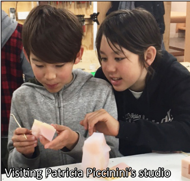
Visiting Patricia Piccinini's studio