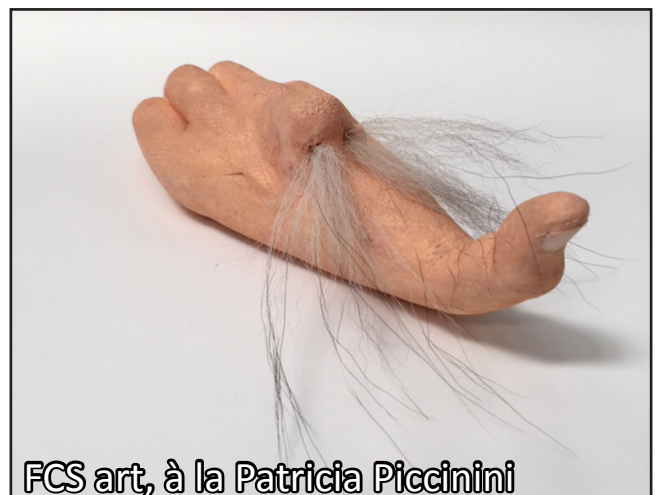
FCS art, à la Patricia Piccinini