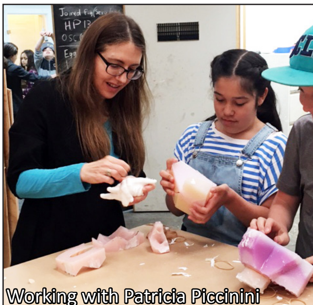
Working with Patricia Piccinini