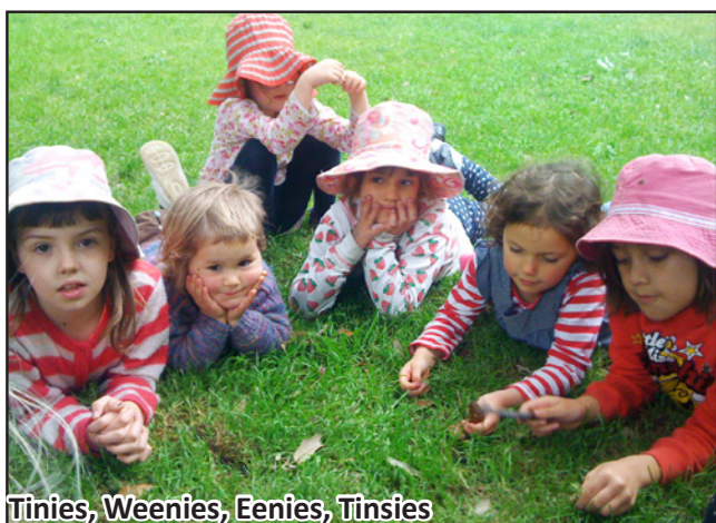
Tinies, Weenies, Eenies, Tinsies