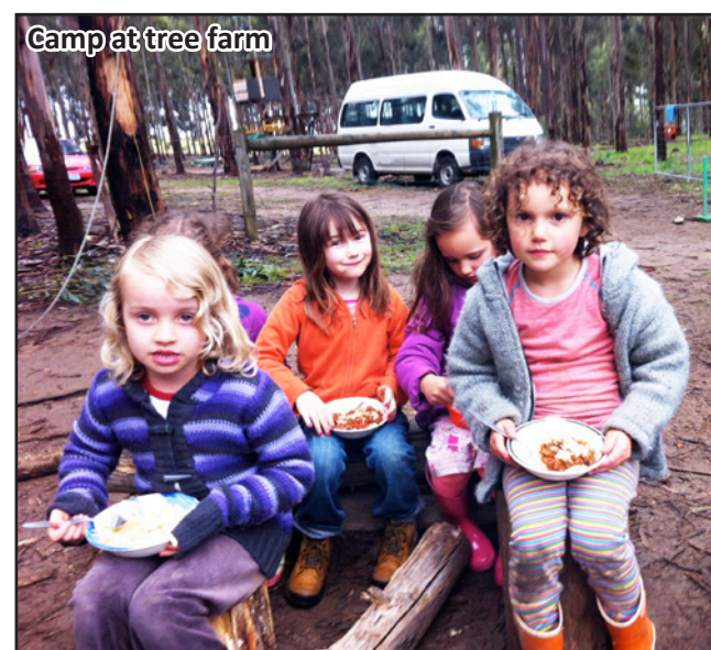
Camp at tree farm

The Reds also had their chance to bush-bash, with Greta and Netti escorting them to The Land in October. They discovered