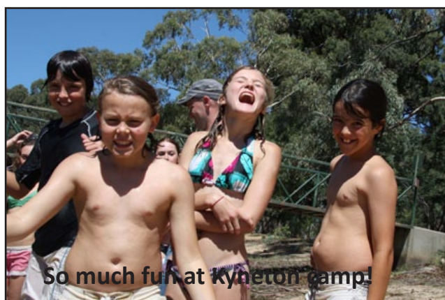
So much fun at Kyneton camp!