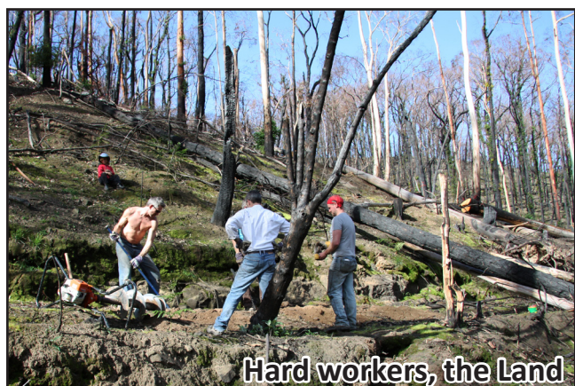
Hard workers, the Land

We will be having an official opening ceremony for the new multipurpose room dubbed The Eyrie, as well as the refurbished maths room and the new True Blue Toilets. This will take place at 3:30pm on the 11th November in the company of The Hon Lindsay Tanner MP or a representative. All are welcome to attend.