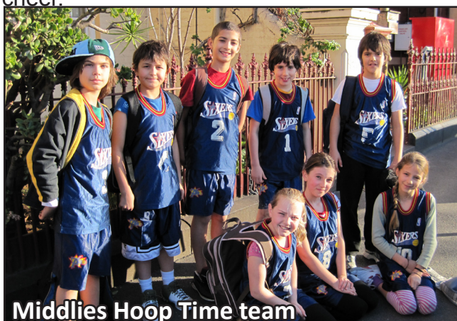
Middlies Hoop Time team