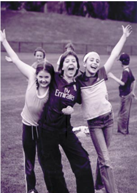
A joyful moment in the Edinburgh Gardens